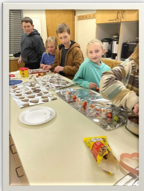
Cooking Meeting, making chocolate covered strawberries.