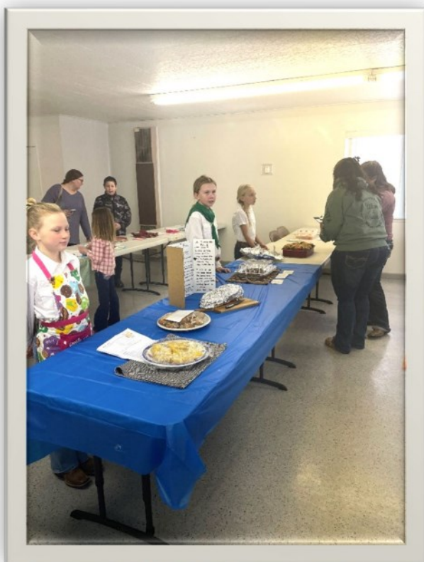
Fort Jones 4H Club Members with Cooking Entries at the Home Ec Day.

Fort Jones Club Projects are in full motion coming into the spring season. Cooking club had their first meeting where they made sliders, chocolate heart cookies, and chocolate covered strawberries. The club had good representation at the Country Presentation and Home Ec Field Day, with one presentation and several entries for cooking and crafts.