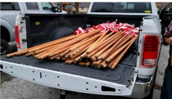
These are flags in the back of Mark Smith's truck