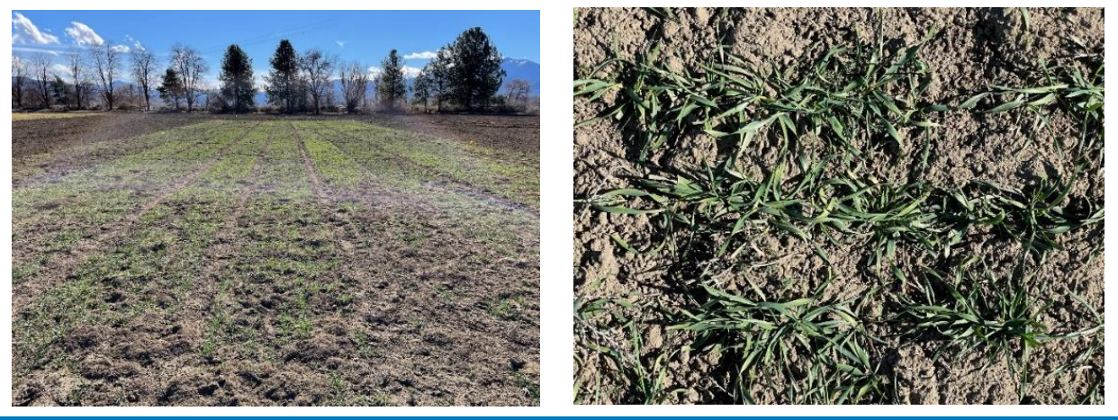
Figures 1 (left) and 2 (right). Both pictures were taken on February 14, 2022. At this time, the crop had not received any fertilization or irrigation. From the planting date (Oct 21<sup>st</sup>, 2021) to the date when these pictures were taken, the crop had received 5.1 inches of rain.

b. Hay Yields: In the summer of 2022, there will be one harvest to compare the species' yields on dry matter basis. A subset of samples will be collected to obtain each species' dry matter percentage.