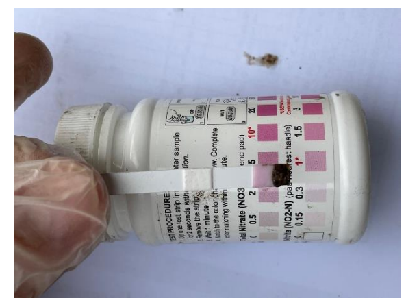
Figure 4 (left). Soil sampling zigzag pattern. Figure 5 (right) Nitrate Quick Test result strip comparison (2ppm).