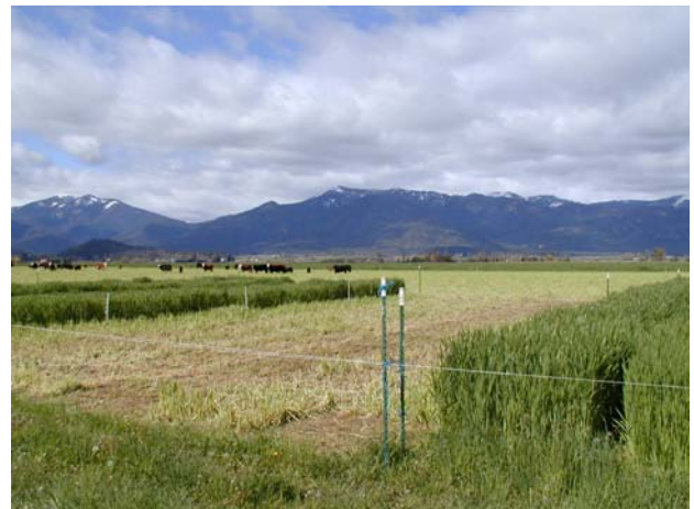
Late August planting of triticale provided fall grazing and outstanding spring grazing (shown) in test plots in Scott Valley.

But I do not have water for fall irrigation, or I cannot plant by early September! Observations show some growers have been successful planting in October or November like a winter grain crop. They have used Trical 102 at 80 to 100 pounds per acre. If a "normal" winter occurs with adequate rainfall, the crop will respond to a spring application of nitrogen. With a "normal" winter and spring, grazing is done in April and/or May. Then, after a re-growth period growers graze it out or let it go for hay production. Most growers have reported triticale far outyields wheat with this type of program.